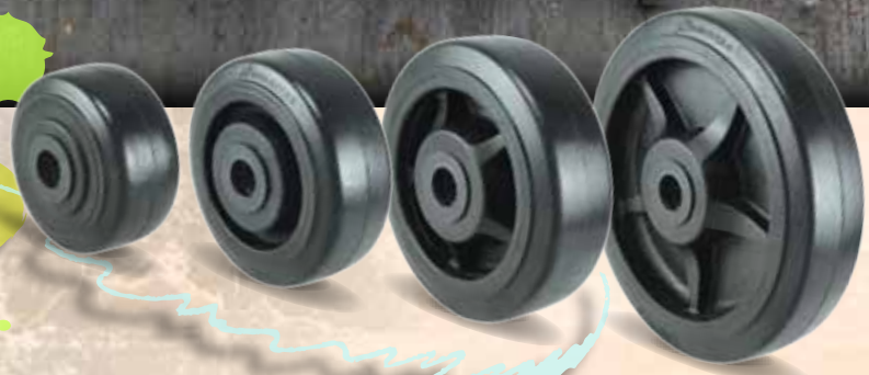
Rubber on Glass-filled Nylon | RN

GLASS-FILLED NYLON (HardCore) chemically engineered to specifically replace steel core wheels (aka cast-iron). NO COMPARISON IN PERFORMANCE! Lab tested, Field tested, Customer approved.