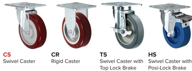
CS Swivel Caster CR Rigid Caster TS Swivel Caster with Top Lock Brake HS Swivel Caster with Posi-Lock Brake