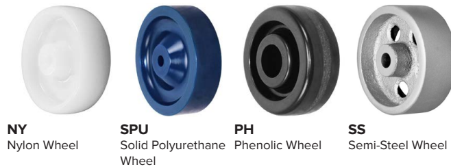
NY Nylon Wheel SPU Solid Polyurethane Wheel PH Phenolic Wheel SS Semi-Steel Wheel