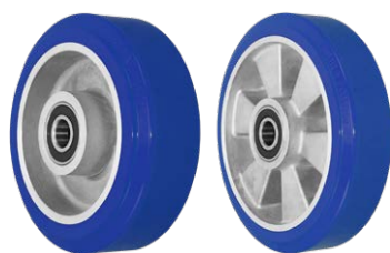
Waffle Core - W